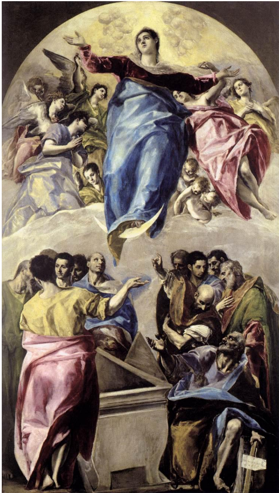
El Greco, Assumption of the Virgin , 1577 Art Institute, Chicago, US