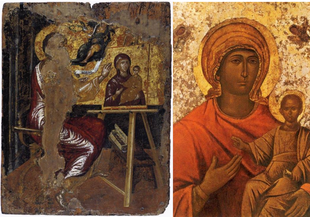
El Greco, St Luke Painting the Virgin and Child , before 1567, Benaki Museum, Athens, Greece (left) The Virgin Mesopanditissa , 12 th or 13 th century, Santa Maria della Salute, Venice, Italy (right)

The heavily-damaged St Luke Painting the Virgin and Child is one of El Greco's earliest surviving Cretan icons, and the only extant example of this most commonly depicted subject of Cretan icon painters. 21 Dubbed without exception, one of the finest of the era , the image's flawless execution testifies to the artist's skill in Byzantine-style icon painting. Compositionally, it differs little from other contemporary versions, but there are traces of his employing two rather distinct artistic styles, Western and Eastern, within the same work. Although the small icon of the Hodegitria is based entirely on late-Byzantine pictorial conventions which were common to Cretan iconographers, aspects of the work are enlivened with Western stylistic and iconographic elements. Most obviously, they are evident in the somewhat more modeled figure of St Luke, the naturalism of the angel which hovers above, and the agitated drapery of the figures. The treatment of pictorial space is also approached with a more refined illusionism than one usually sees in the works of Cretan painters. It can be said that this juxtaposition and coexistence of two differing forms within the same work foreshadows the heterogeneous fund of influences he would ultimately accept. 22