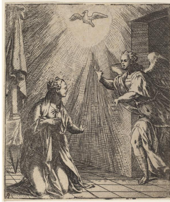
Giovanni Battista Fontana, Annunciation , first half of 16 th century National Gallery of Art, Washington, DC, US

The third multi-panel altarpiece attributed to El Greco's Venetian period is a work commonly referred to as the Ferrara Triptych , which consists of four separate panels that once comprised the lateral wings of a larger ensemble. The paintings, presently at the Pinacoteca Nazionale in Ferrara, differ in their themes from the other examples of El Greco's early portable triptychs. While the Modena Triptych combines scenes from both Old and New Testament events, the Ferrara Triptych only displays episodes from Christ's Passion – Washing of the Feet , Agony in the Garden , Christ Before Pilate , and the Crucifixion . 56 Just as is the case with his aforementioned multi-panel works, the individual paintings have been divided. With regard to iconographic sources, many prints have come to light which reveal the wealth of print sources the artist drew from. The Washing of the Feet finds certain elements in Albrecht Dürer's thematically corresponding Small Passion series, while Agony in the Garden also borrows from prints of the same theme by Dürer, Benedetto Montagna, and Lucas van Leyden. The artist's dependence at this stage is further demonstrated in Christ Before Pilate , as elements are once again borrowed from Dürer's Small and Large Passion as well as various engravings by Enea Vico. Uniquely, the scene of the Crucifixion derives from a single print by Giovanni Battista d'Angeli, 57 the composition one of