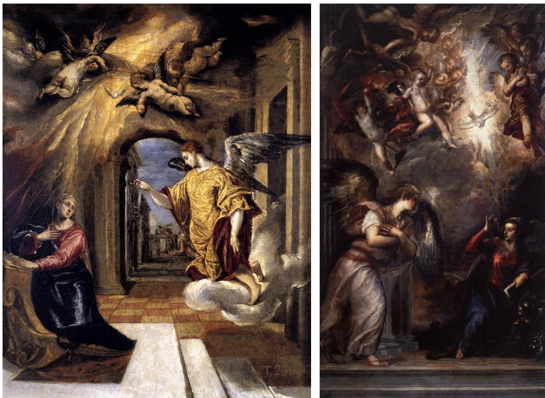
El Greco, Annunciation , c. 1570, Museo del Prado, Madrid, Spain (left) Titian, Annunciation , c. 1559-64, San Salvador, Venice, Italy (right)

of effect. The modulated textured use of yellow pigment which materializes a divine light, as well as the incandescent glow illuminating Mary's face in El Greco's Annunciations , put his appropriation of Venetian coloring practices on full display, as do the Flight into Egypt and the numerous versions of St Francis Receiving the Stigmata . 102 The works' loose, gestural strokes all document El Greco's efforts to denounce the maniera greca in favor of a more Venetian style in these small-scale devotional paintings. The artist dissolves the depicted materials so as to signal the spiritual intensity of the scene as well as his own creative facture, just as Titian did when he loosened his handling of pigment in his later works. In essence, it was the style of these works, and not their direct compositional structures, which was to guide El Greco's appropriation of the Venetian style. In it, he saw the means to render images in a way that emphasized the mystical properties of the events portrayed for the purpose of heightening devotional and emotional impact. 103