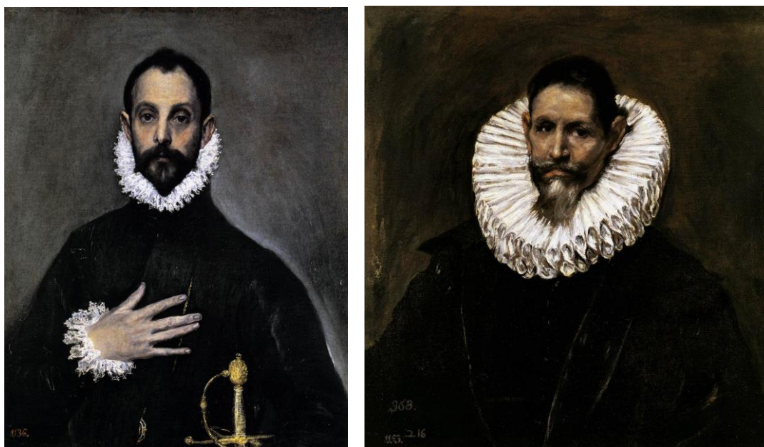
El Greco, Man with His Hand on His Breast , 1583-85, Museo del Prado, Madrid, Spain (left) El Greco, Jerónimo de Cevallos , c. 1610, Museo del Prado, Madrid, Spain (right)

swaying in the wind is a compositional element that can be seen in many works by mid-sixteenth-century Venetian artists, and it speaks of the influence he directly picked up in Venice before his arrival in Rome. This, along with the portrait's brushwork and its treatment of color express El Greco's personal ambition to fashion himself a Venetian-trained painter. The Farnese collection in Rome contained large numbers of paintings by Titian and other Venetian masters, 118 and the artist could have used this portrait as a means of aligning himself with the talents he had studied during his sojourn in Venice. 119