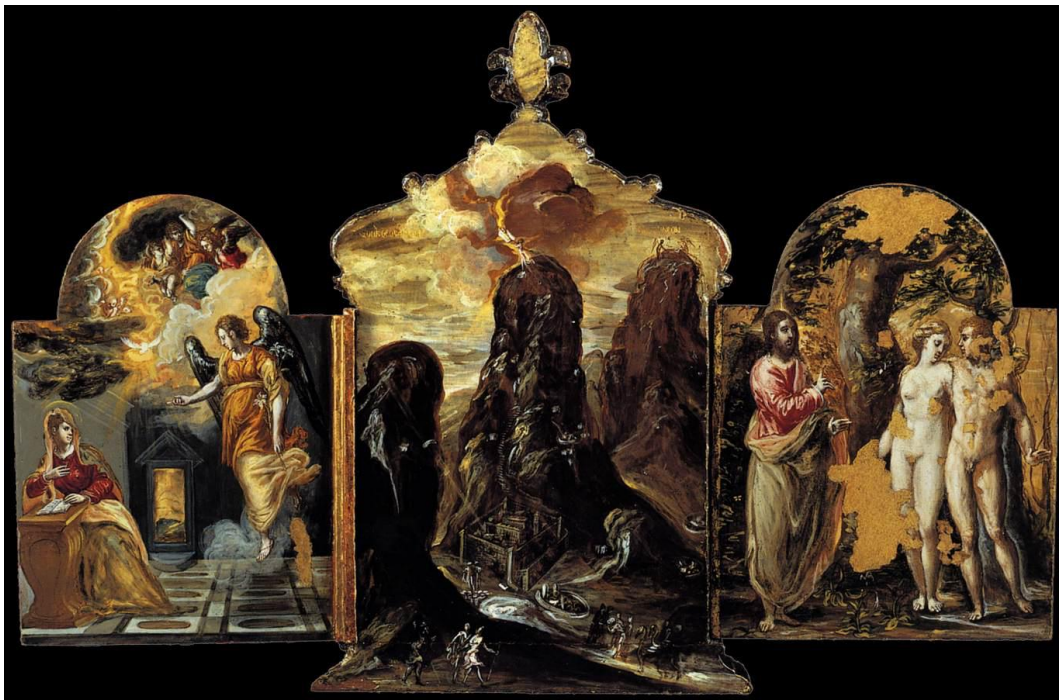
El Greco, Modena Triptych , showing the Annunciation (left), View of Mount Sinai (center), and Expulsion from Paradise (right), c. 1567 Galleria Estense, Modena, Italy

Each of the three triptychs originally constituted two lateral wings attached to a central panel into which the sides could be folded 50 , with the relative thinness of both wooden boards which comprise the Heraklion work implying that each was at one