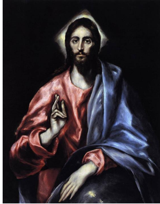
El Greco, St Dominic in Prayer , 1586-90, Private collection (left) El Greco, Christ as Savior , 1610-14, Museo de El Greco, Toledo, Spain (right)

The Venetian treatment of color more blatantly present in earlier works and later subdued to the advantage of a Roman, Spanish, and distinctly individual style nonetheless reappeared in many later paintings. Perhaps the most telling are examples of portraiture. His melodious, quiet, and purposive portrait of a Spanish nobleman from the late 1570s, entitled Man with His Hand on His Breast , is characterized by a dramatic technique that marked works by Tintoretto, Titian, and other Venetian masters – the illuminated hands and face of the subject are thrown into relief against a very dark background. The subtle contrasts of dark and light, of the showy and the discreet, and the realistic and the abstract are all undeniably Venetian stylistic markers as well. 116 El Greco's role of passionate and responsive interpreter of the 16 th -century Venetian liberation of color and light is blatant in another portrait, that of Jeronimo de Cevallos from the first quarter of the 17 th century. The work has been called the richest and revealing of all of Greco's late portraits . 117 Another earlier of his works and one of the relatively small number of portraits attributed to the artist during his Italian period, the Portrait of Giulio Clovio from c. 1572 clearly once again betrays the influence of Titian. The open window looking onto a turbulent landscape of trees