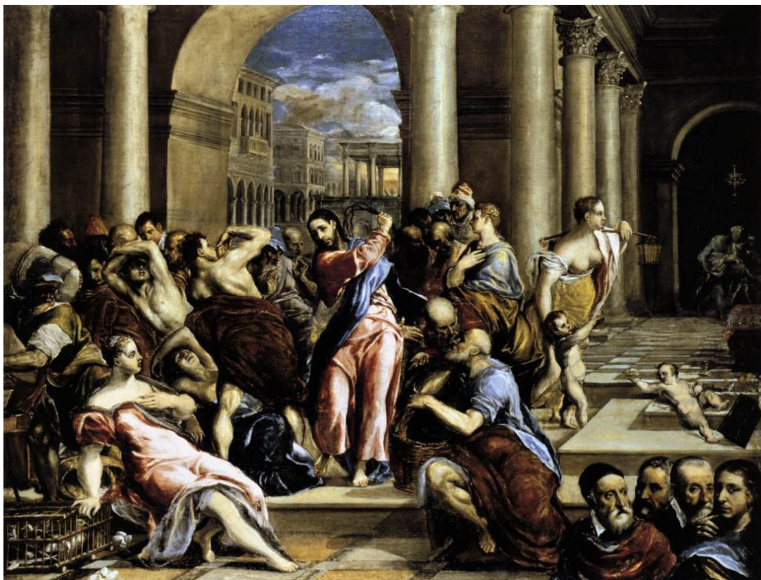
El Greco, Cleansing of the Temple and detail (below), c. 1570 Minneapolis Institute of Arts, Minneapolis, US

much that Ellis Waterhouse dubbed him an eclectic borrower . 91 In his Cleansing of the Temple , he transparently pays homage to four Italian artists whose work directly influenced his own. In the lower right-hand corner of his second version of the painting, El Greco somewhat tellingly inserted first Titian, then Michelangelo, Giulio Clovio, and finally an unascertained portrait of what is presumed to be Raphael. 92 The figures, of whom three are the triumvirate of the most celebrated artists in 16 th -century Italy, are spatially and thematically removed from the narrative, and they function as almost a meta-pictorial footnote which credits the plurality of influence which contributed to his artistic development in Italy. The painting itself appropriately exhibits a summa of his study of those same artists – most notably the plasticity of Michelangelo and the color and brushwork of Venetian artists, namely Titian. 93