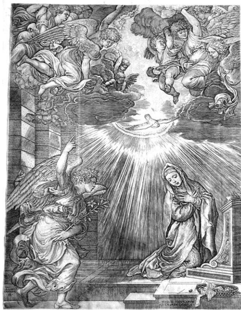
Gian Giacomo Caraglio (after Titian for Santa Maria degli Angeli, Murano), Annunciation with Angels , c. 1527-37 Scottish National Gallery, Edinburgh, Scotland