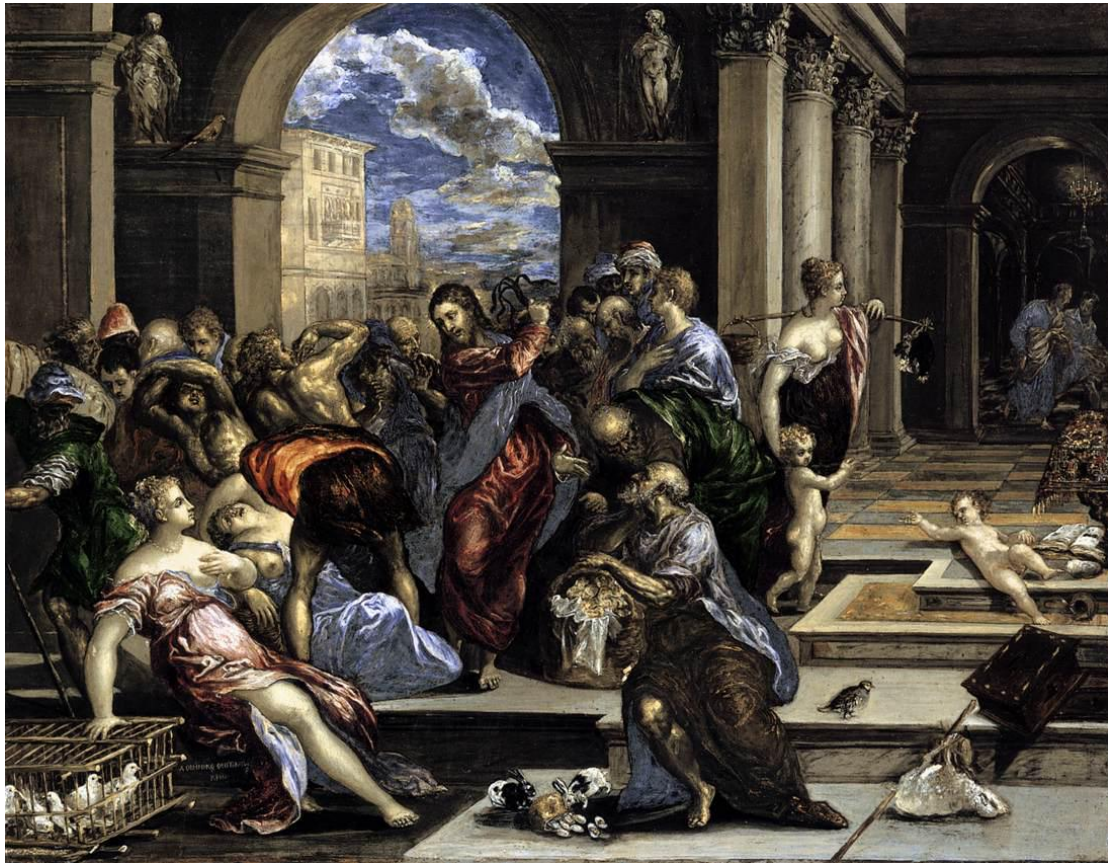
El Greco, Christ Cleansing the Temple , before 1570 Samuel H. Kress Collection