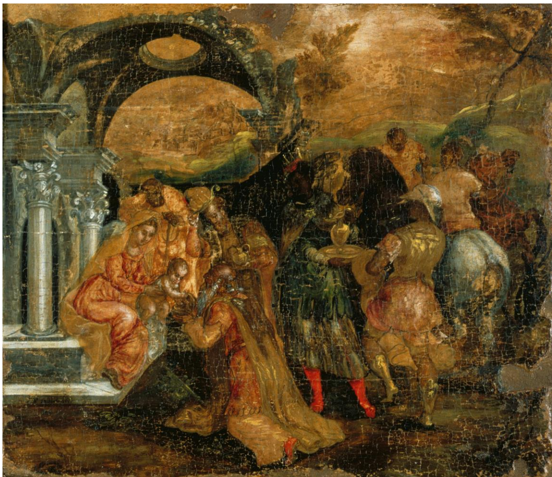
El Greco, Adoration of the Magi , before 1567 Benaki Museum, Athens, Greece