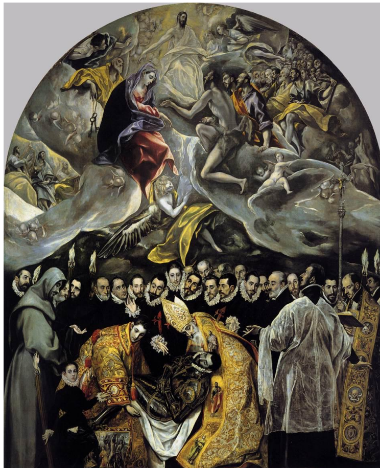
El Greco, Burial of the Count of Orgaz , 1586-88 San Tomé, Toledo, Spain

is also distinctly Byzantine. 113 The Eastern character of The Savior , painted in Spain between 1604 and 1614, is said to be unmistakable , and Leo Bronstein remarks that it is puzzling to find such typical, conventional, and external traits of Byzantine art in a work so late and within a period of El Greco's activity so emancipated – the facial type, the hieratic gesture, rigid frontality, intense fixity of the eyes all attest to an essentially retrospective stylistic source. Perhaps the painting was commissioned by one of his numerous refugee compatriots in Spain, but the pictorial idiom chosen is nonetheless distinct and interesting to note. 114 In Descent of the Holy Ghost , painted between 1603 and 1614, the geometrical armature of flattened space draws once again on the artist's Byzantine ancestry. 115