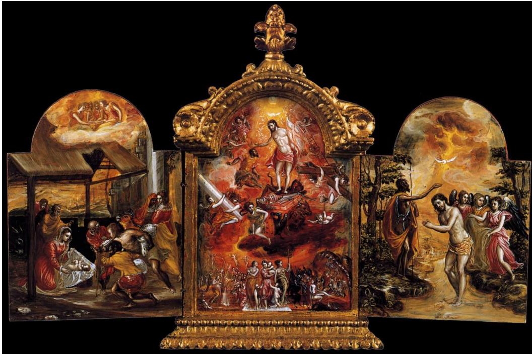
El Greco, Modena Triptych , showing Adoration of the Shepherds (left), Christ Crowning the Christian Soldier (center), and Baptism of Christ (right), c. 1567 Galleria Estense, Modena, Italy