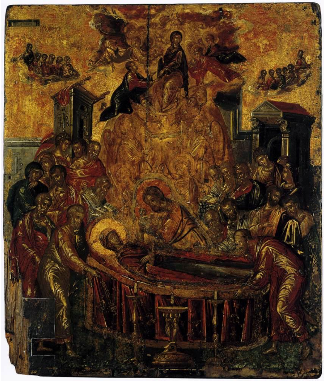
El Greco, Dormition of the Virgin , c. 1565 Holy Cathedral of the Dormition of the Virgin, Ermoupoli, Greece